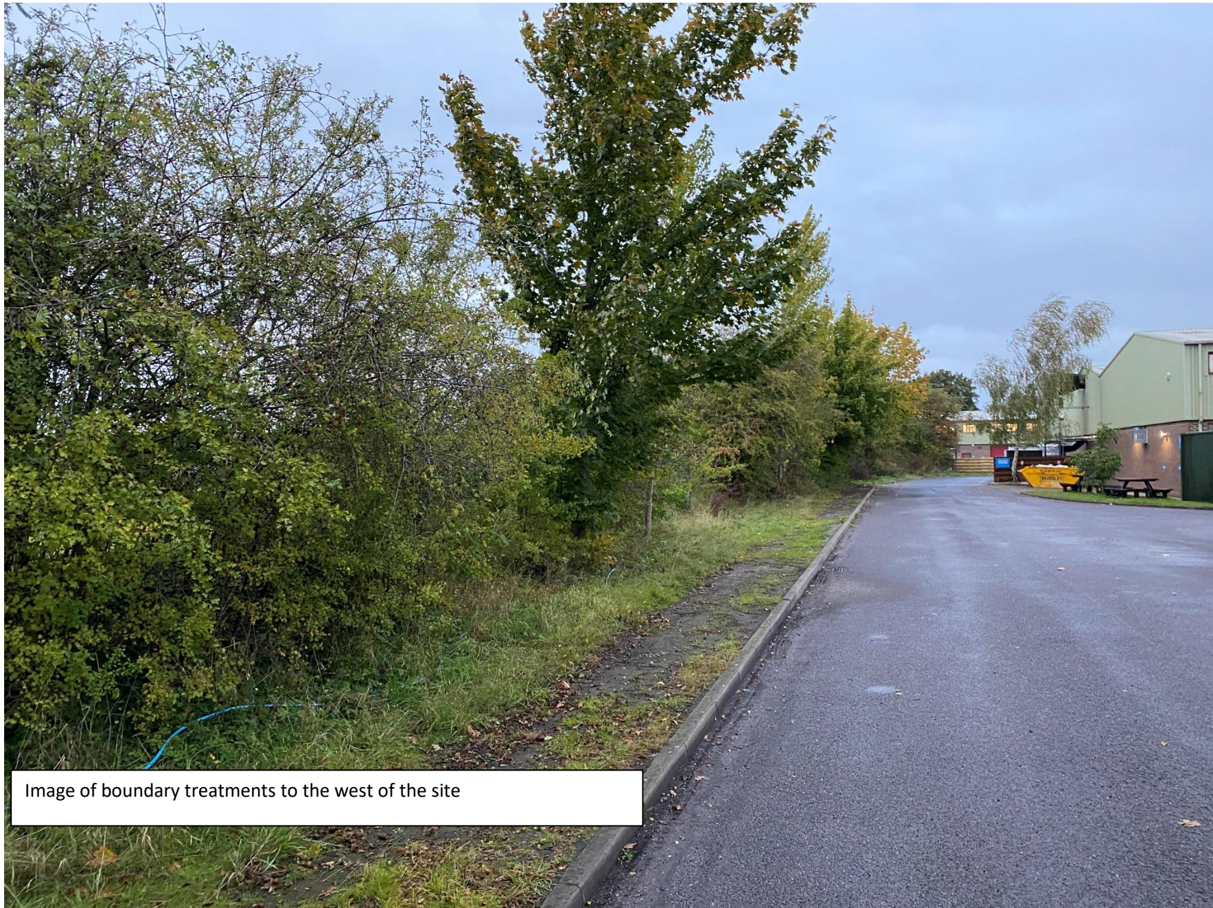
Image of boundary treatments to the west of the site