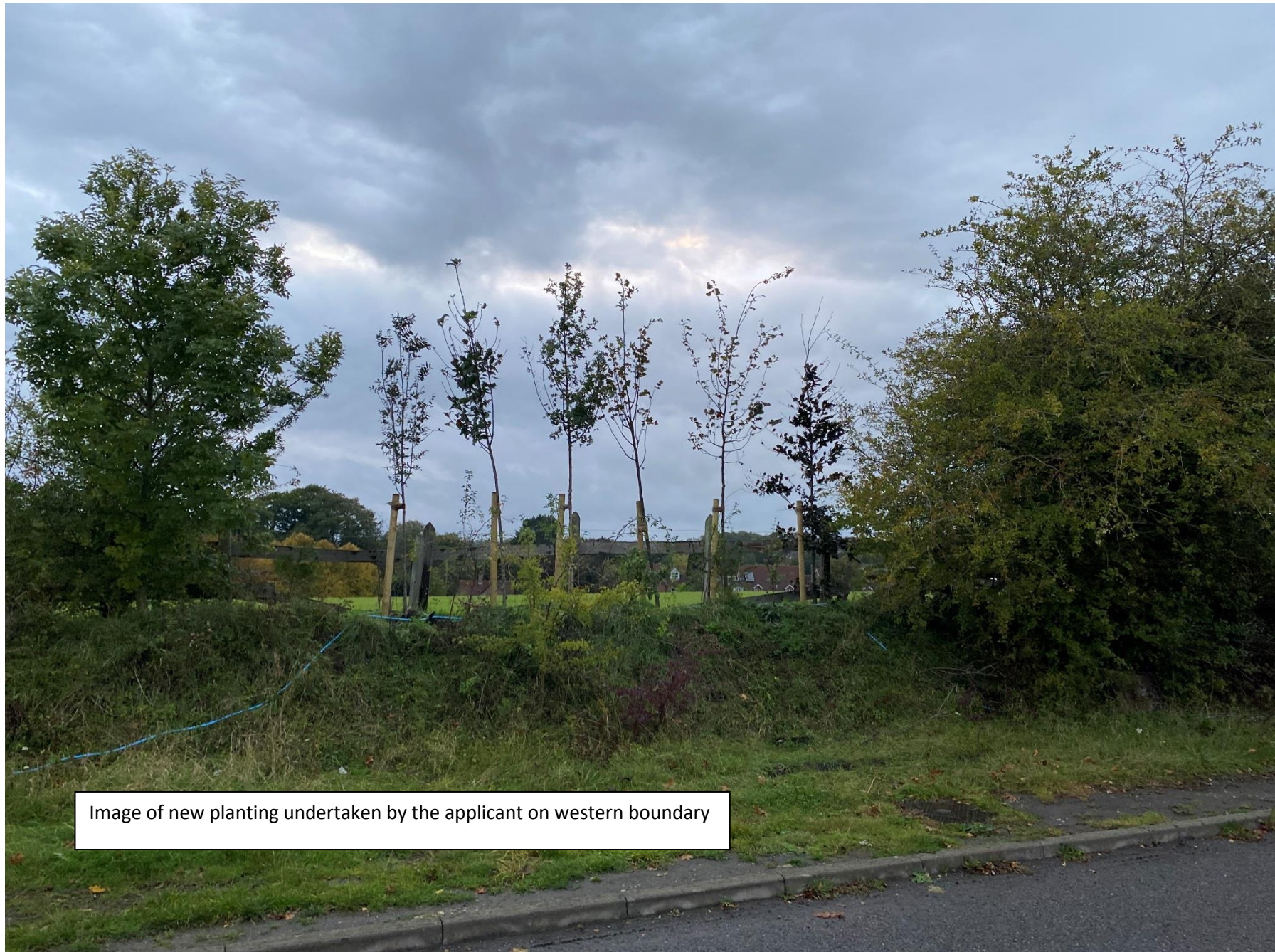
Image of new planting undertaken by the applicant on western boundary