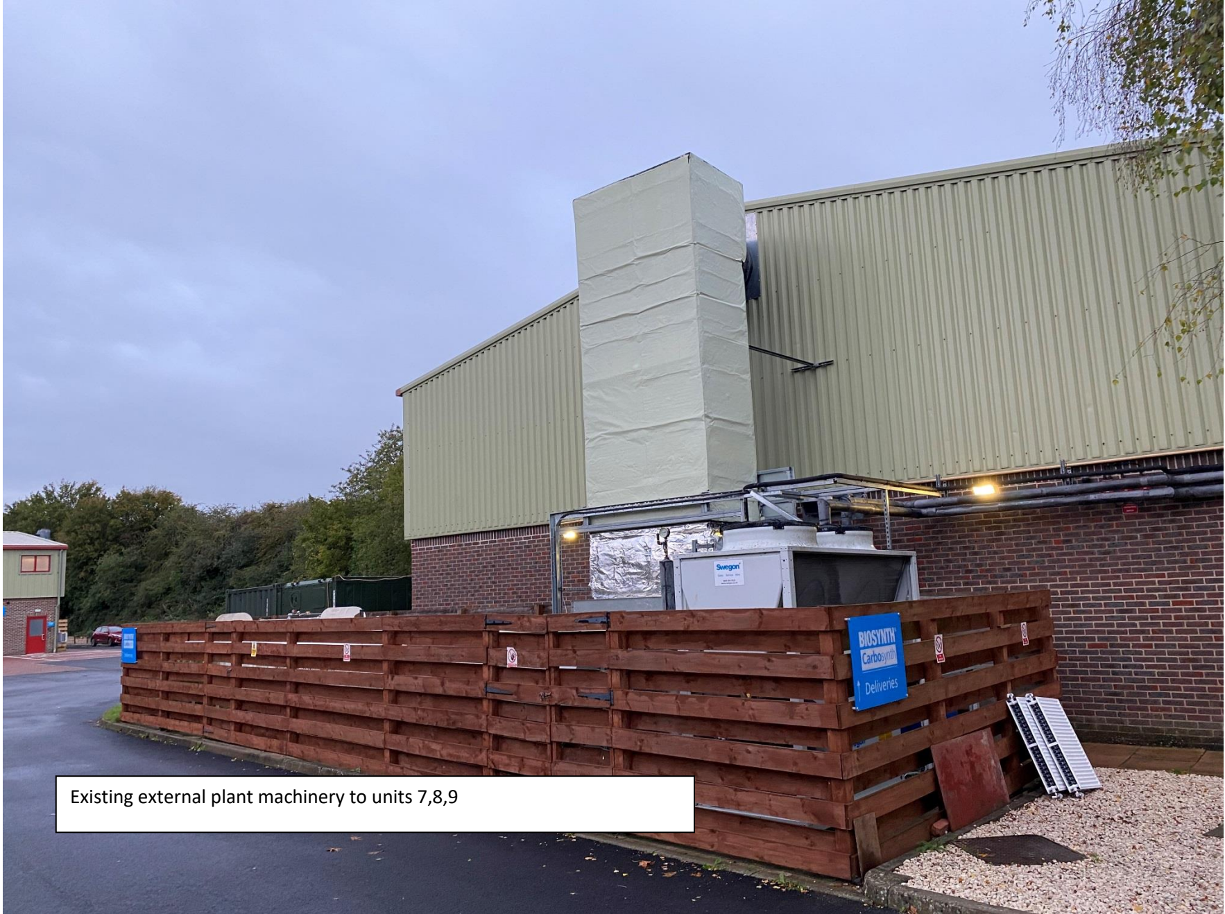
Existing external plant machinery to units 7,8,9