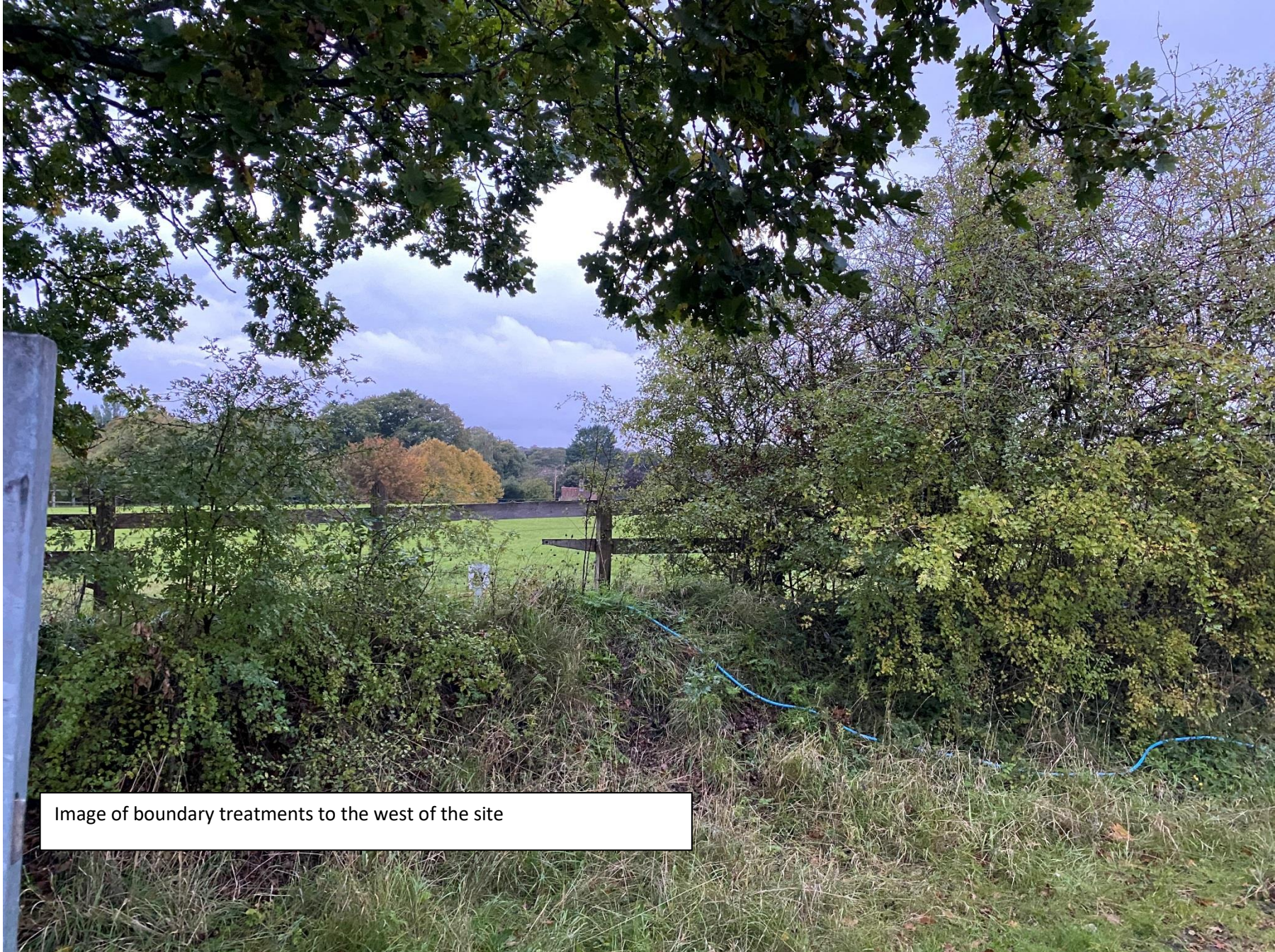
Image of boundary treatments to the west of the site