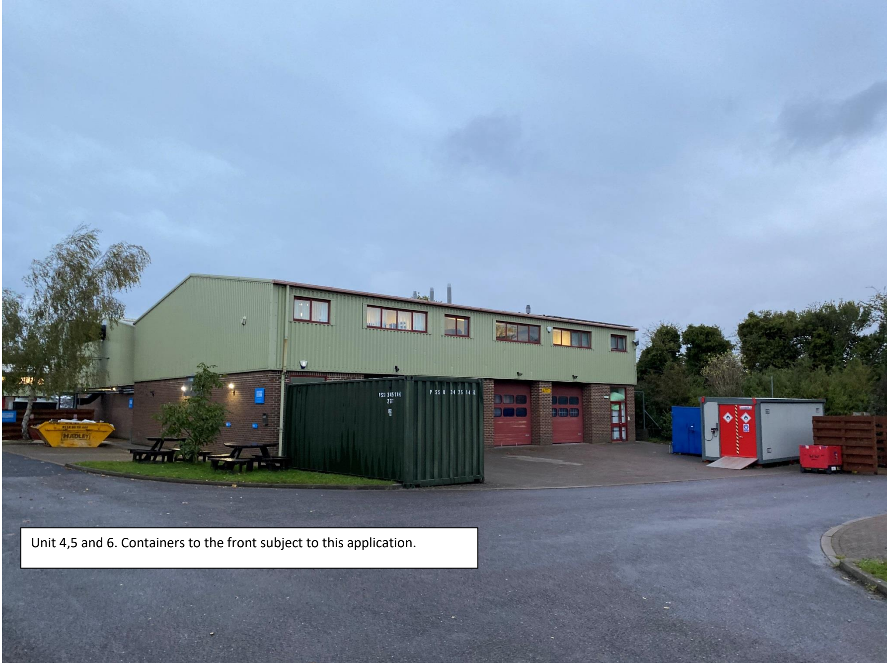
Unit 4,5 and 6. Containers to the front subject to this application.