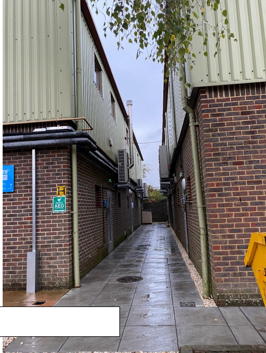
Gap between the two units