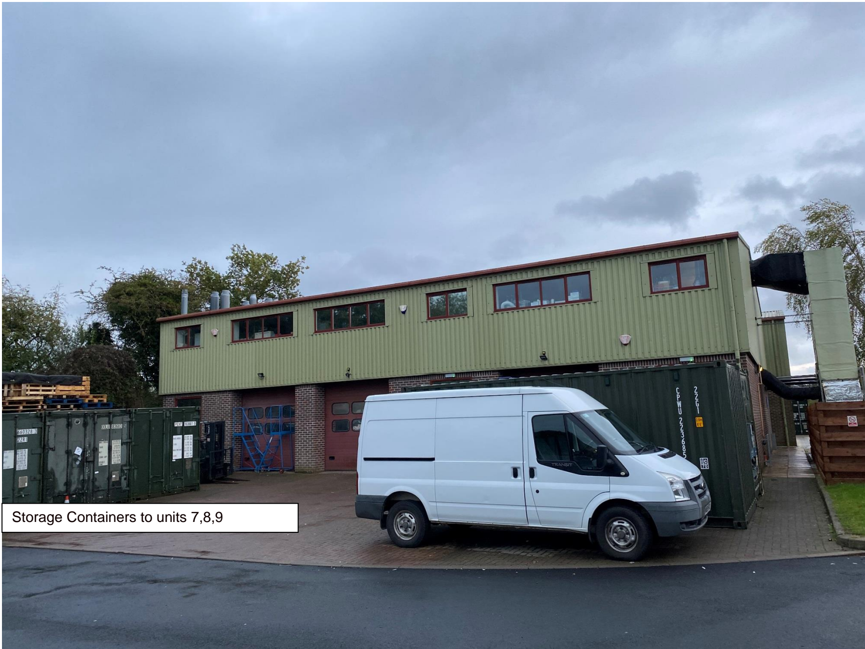
Storage Containers to units 7,8,9