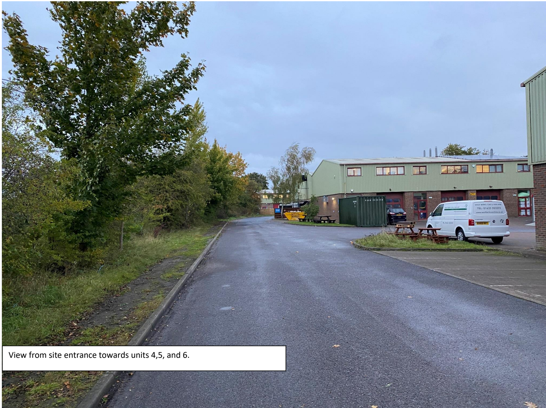
View from site entrance towards units 4,5, and 6.