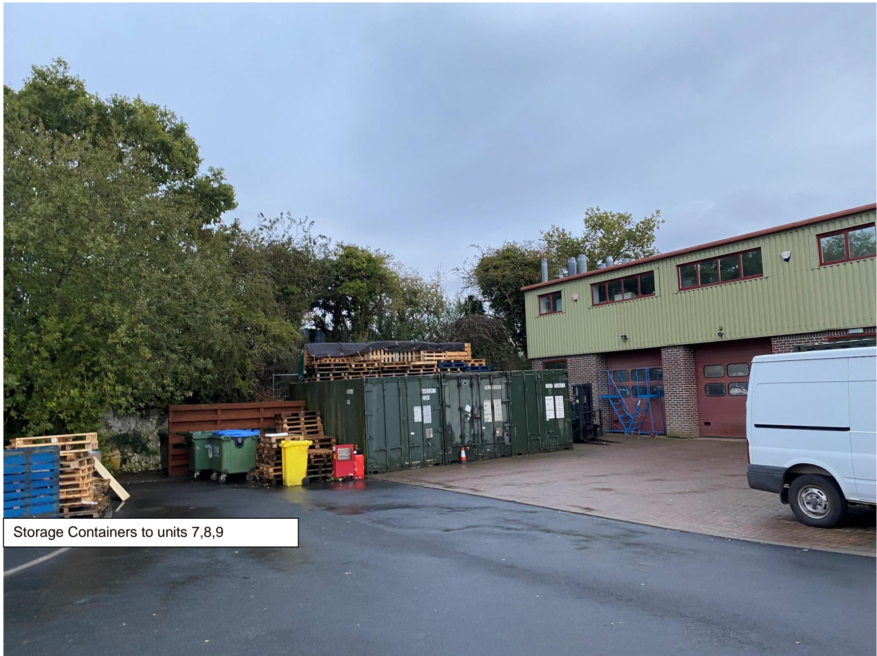
Storage Containers to units 7,8,9